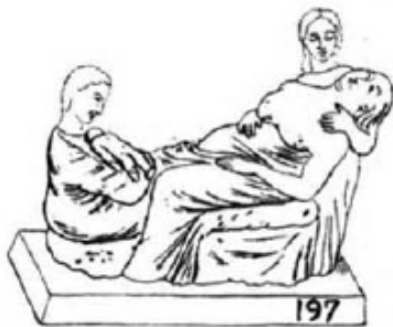
The Ancient Birthing

The Egyptians used belly dancing as a laboring tool. The Zulu Indian birthing mother was silent during labour while the women in her family would cry out and groan in sympathy. The father of the baby was heavily involved during the birthing rituals of a Mexican tribe. He hung from the ceiling with each scrotum tied by strings held by the birthing mom. As she screamed in pain she pulled the strings, allowing him to understand the "pain" of labour.