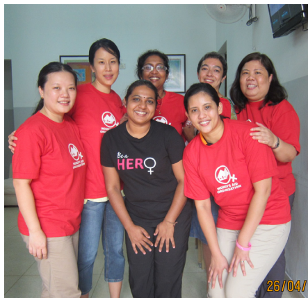
The team from OGSM with WAO representatives