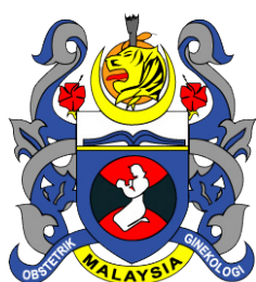
Obstetrical & Gynaecological Society of Malaysia