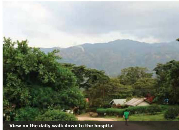
View on the daily walk down to the hospital

There were women sitting out on the lawn just outside the ward, and the hospital had set up a makeshift tent as a ward to accommodate the patients post operatively.