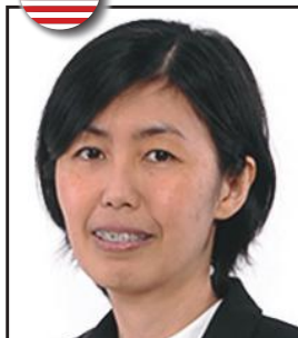
Dr Hon Sook Kit Malaysia