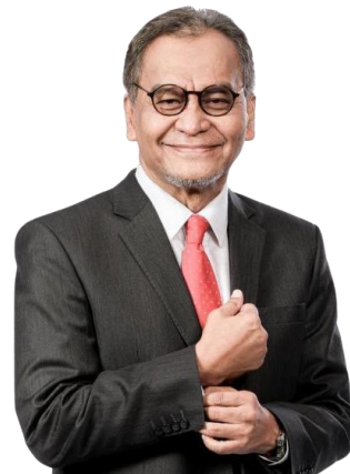
YB Datuk Seri Dr. Dzulkefly bin Ahmad Minister of Health Malaysia